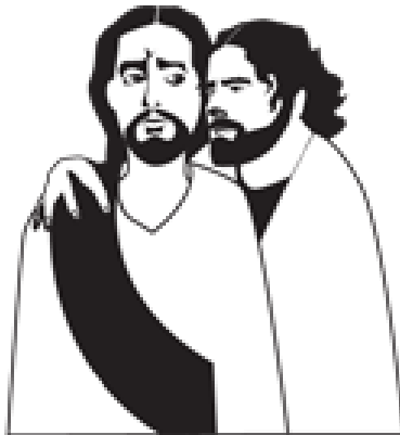
Judas Betrays Jesus